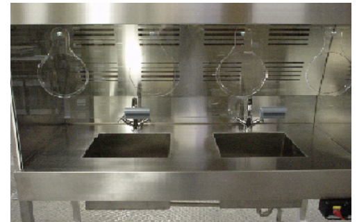
special structure stainless steel atex exproof

PPH: Compatible with the use of acids and bases to 110 ° C. EMALIT: securit colored glass guaranteeing a perfect flatness of the work plan. Good resistance to solvents and acids, at low and high temperature Stainless steel: resistant to solvents and very high temperatures.