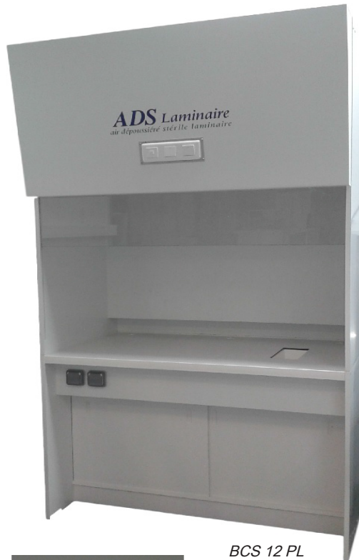
BCS 12 PL