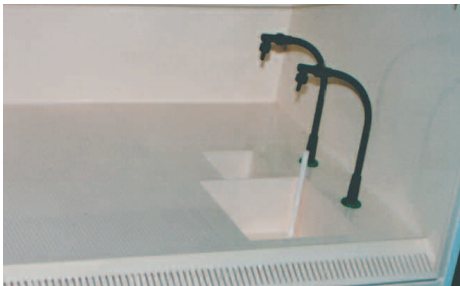
Workplan with PPH guard vein

PVC: Compatible with the use of acids and bases to 60 ° C