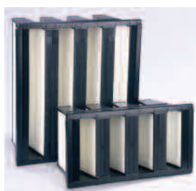
Rigid bag filters

filter<<with pockets>>Has a large capacity, a high flow of air, a very high efficiency: 95% for particles of 5 microns (OPACIMETRIC).