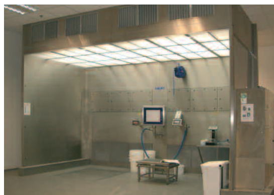
100% fresh air Cabinet - Cosmetic industry