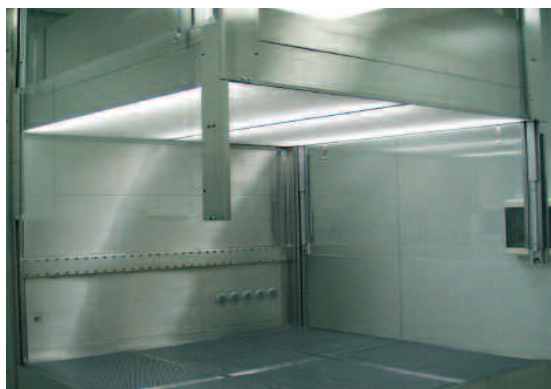
Cabinet with perforated worktop recovery