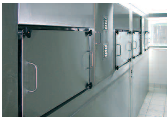
pharmaceutical industry Cabinet