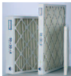
G4 filters in prefiltration (option)