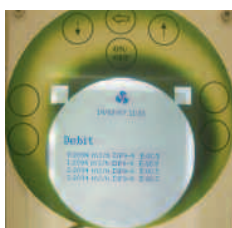
Flow rate display