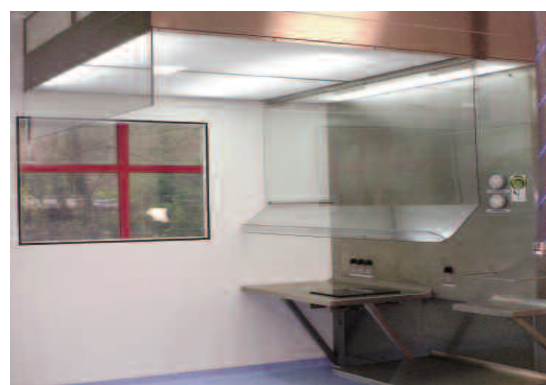
pharmaceutical industry Cabinet