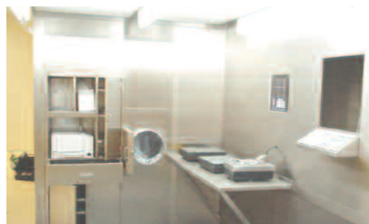
Cabinet integrating a computer weighing system Computer niche and table for fine weighing. Pharmaceutical industry