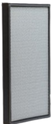
High-efficiency air filter