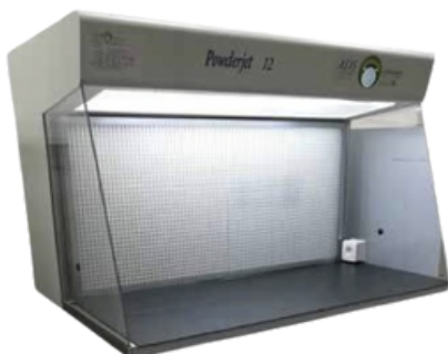
Laminar flow cabinet