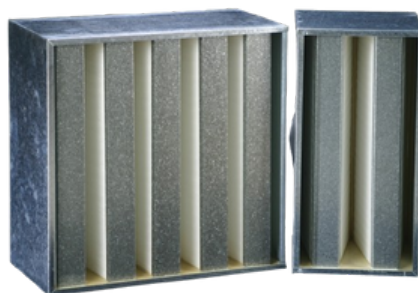
High-flow absolute filter