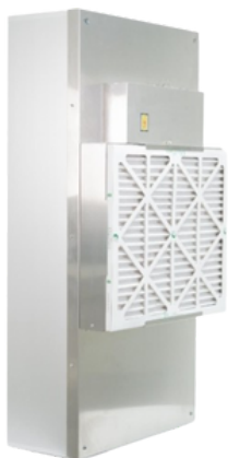
Fan Filter Unit

Discover our complete range of air filters