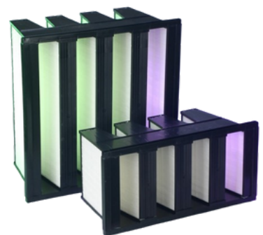
Rigid Pocket Filter V Cells